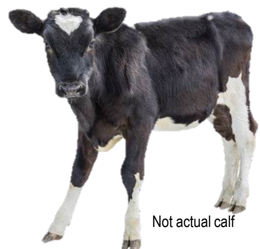
Not actual calf

For those 2022 Champaign County Fair participants in attendance, we will have a drawing for several door prizes including a Holstein calf, a wooden hutch, halters and more at the conclusion of the clinic. Must be present after QA to win. Calf donated by Champaign County Dairy Council